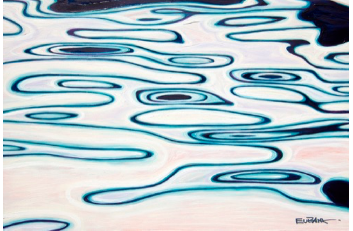
Southern Ocean VII, oil on board, 9 x 12 inches