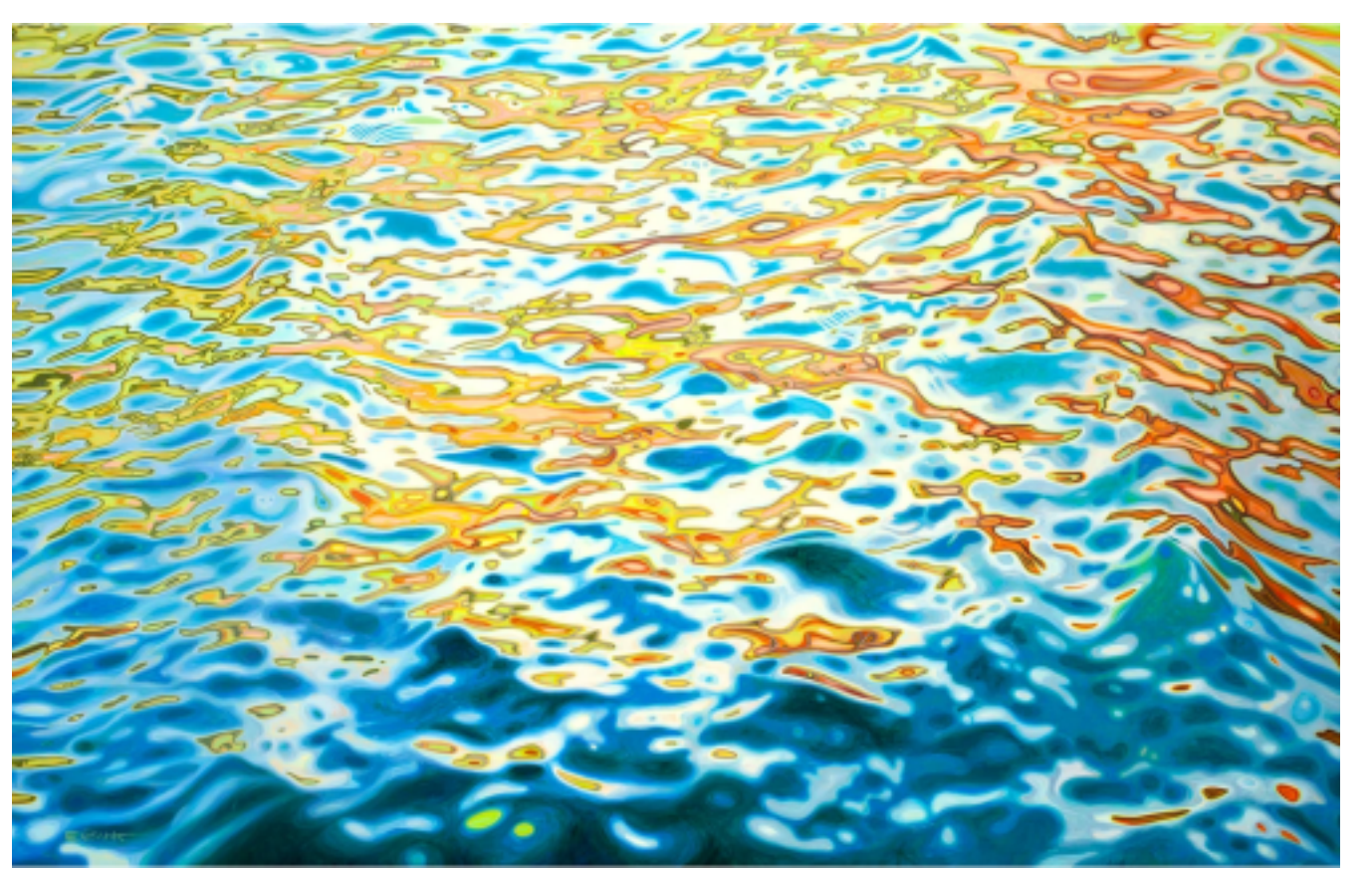
Santa Cruz Island V, oil on linen 42 x 66 inches